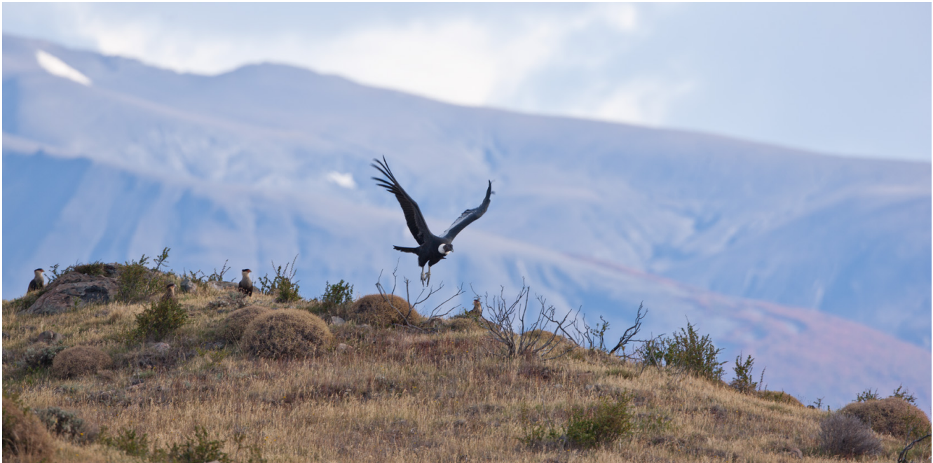
Andean Condor